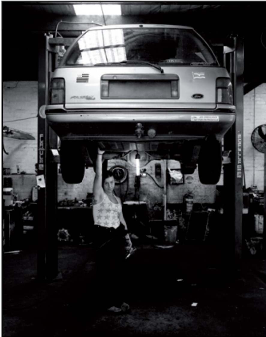
Leticia, Trainee Mechanic.